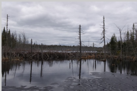
Our operational area is a perfect mix of boreal forest, cedar bogs and cropland

The northern and eastern ranges of Maine hold the highest numbers of bears and our location at the joining of Penobscot, Washington and Aroostook counties makes for world class black bear hunting habitat.